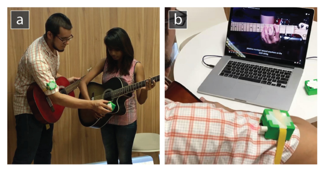
Figure 4. Learning an instrument with MuSS-Bits (a) colocated and through (b) self-learning.

MuSS-Bits support instructed as well as self-learning (see Figure 4). A deaf user could use one MuSS-Bit pair to receive feedback from his or her own instrument about sound he or she created. The user can receive guided feedback by attaching a second pair of MuSS-Bits to a teacher's instrument or to a computer that runs a video tutorial. The second pair will provide a ground-truth to compare and compensate for the gap in the feedback loop.