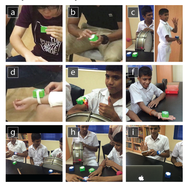
Figure 5. Deaf users interacting with MuSS-Bits: (a) blowing into microphone; (b) tapping on Sensor-Bit surface (c) participants playing a counting game; (d) Display-Bit worn around the wrist, (e) the upper arm and (f) held on the hand; (g) collaborative music-making; (h) sharing of a Display-Bit; (i) following an online tutorial.

MuSS-Bits can be attached to each other easily with the built-in magnets. This allows users to create composite Display- or Sensor-Bits. A deaf user can, for example, combine a set of Display-Bits to create a seat mat to receive vibrotactile feedback while playing a piano. In a collaborative music session, performers can join their Display-Bits to create a shared visual display representing each performer as one pixel.