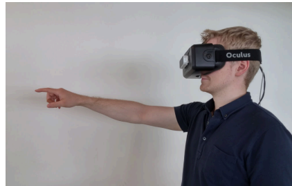
b) User, interacting with the system