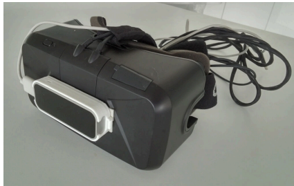
a) Oculus Rift and mounted Leap Motion

2 MIT Media Lab, Cambridge, MA USA. jhuber@mit.edu